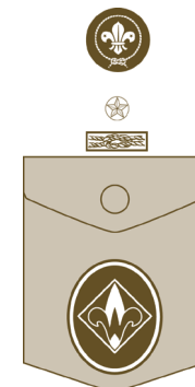
LEFT POCKET, (TAN SHIRT)