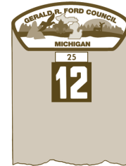
OPTIONS FOR LEFT SLEEVE