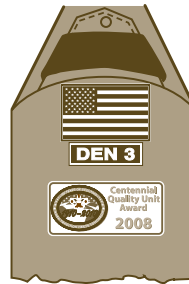
WITH DEN NUMERAL