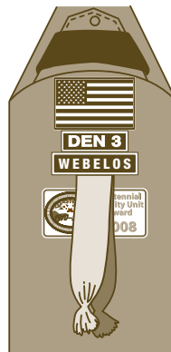
WITH DEN EMBLEM